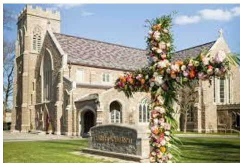
Center Renewal: Christ Church, Greenwich CT