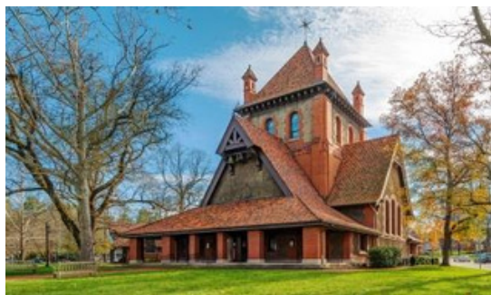
New Center: The Cathedral of All Souls, Asheville NC

What a joy it is to welcome a new center and a center renewal into the COHI family!