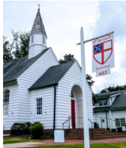
St. Margaret's Episcopal Church, Carrollton, GA