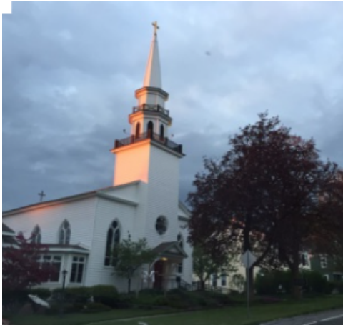
Christ Episcopal Church, Manlius, NY